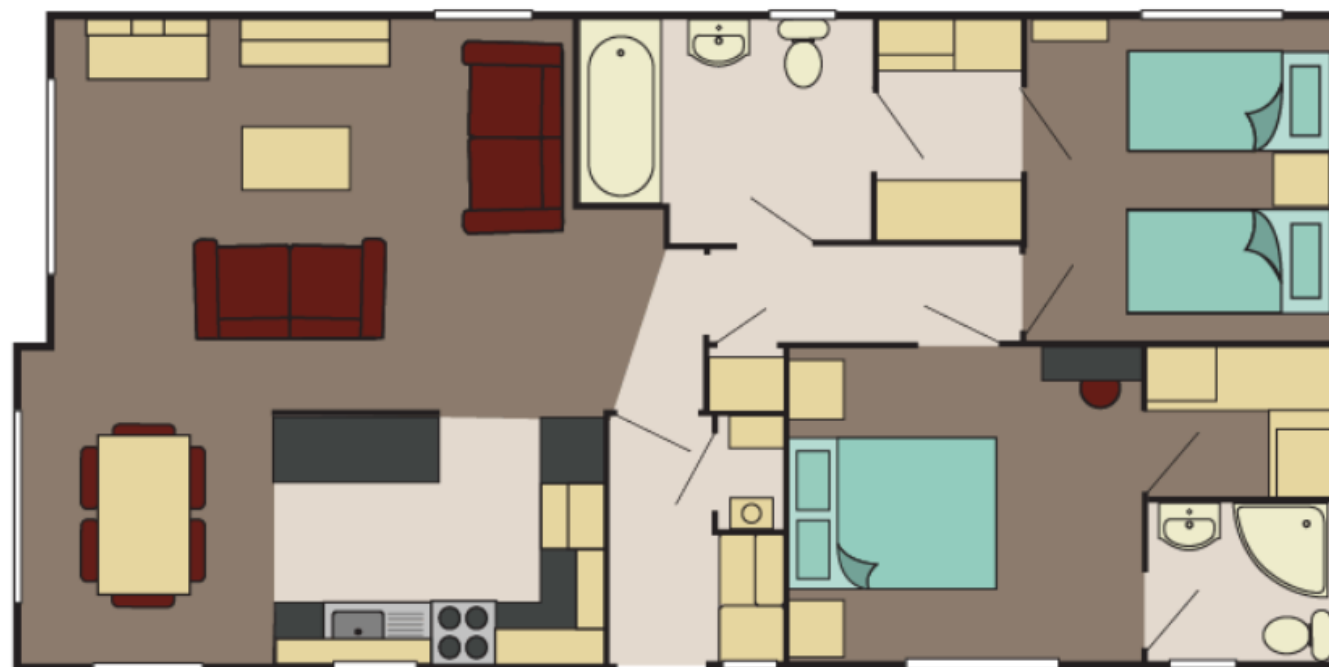
COUNTRYSIDE ( 40FT X 20FT) 2 BED FLOORPLAN

This residential lodge is designed to give a warm country feeling at a great price. You get all you need in comfort and space from the clever styling. Comfy sofas, separate dining area and well fitted kitchen are all included in the Countryside Lodge along with plenty of storage space including lift up main bed with storage beneath, two shower rooms – one with a bath in the larger lodges, it also has the added advantage of a useful utility room with washer/dryer space, cloak cupboard and door to the exterior.